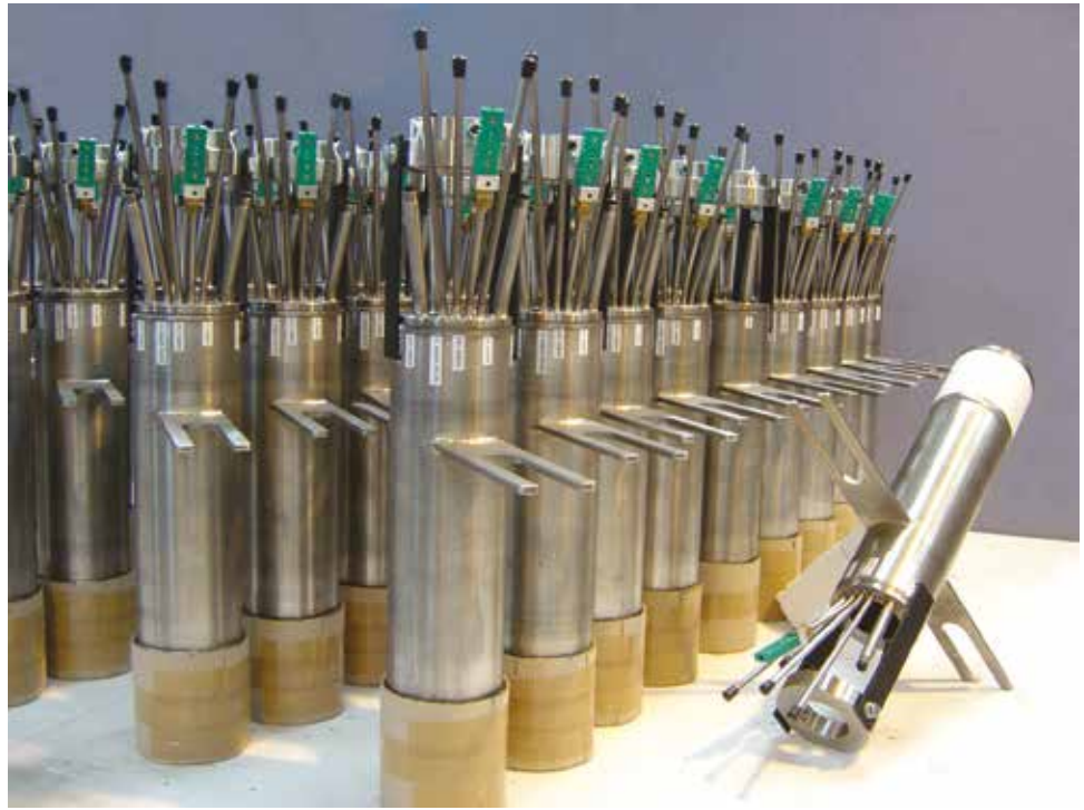
Group of 76mm Vertical Splashguard (VS) electrode holders.

The long-established Molycool range of electrode holders, primarily used for vertical electrodes, offers the lowest level of heat extraction from the electrode block through the design of its cooling coils and two-stage thermal insulation. The Molycool range includes holders to suit 32mm (1.25in), 50mm (2in) and 63mm (2.5in) electrodes and again, in common with