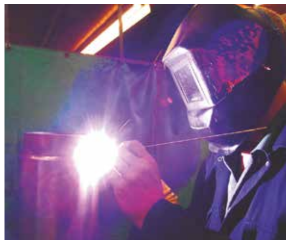
Holders under manufacture at the Electroglass in-house holder workshop.

All of the above are important points to consider when investing in electrode holders and can mean the difference between success and failure of the entire furnace project. With 38 years' experience in electrode holder development and design, Electroglass manufactures all its holders in-house at its own facilities in South East England, ensuring that every holder is produced to the standards required to ensure reliability and long life. ■