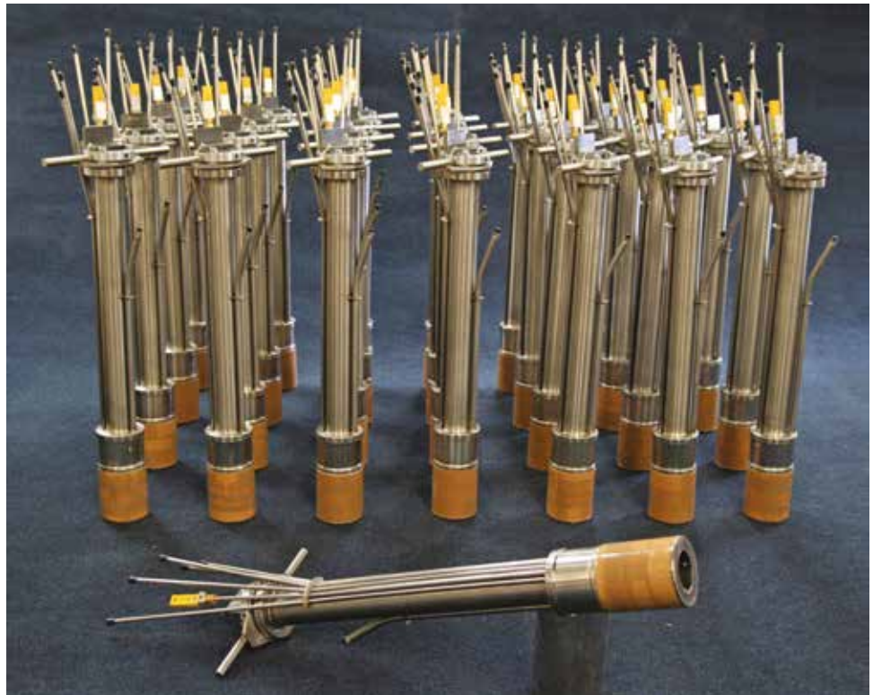
Group of 63mm Molycool electrode holders.

Oxidation of the electrode can lead to increased local temperature being generated where the electrode diameter becomes 'necked down'. This increase in temperature accelerates oxidation, leading to the eventual failure of the electrode which, if not identified, can lead to rapid refractory wear and possible glass leakage.